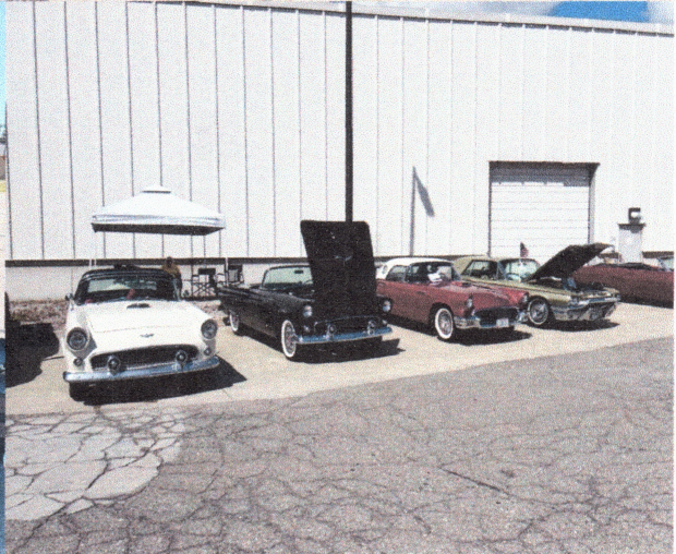
Cars were 55, 56, 57 & 65